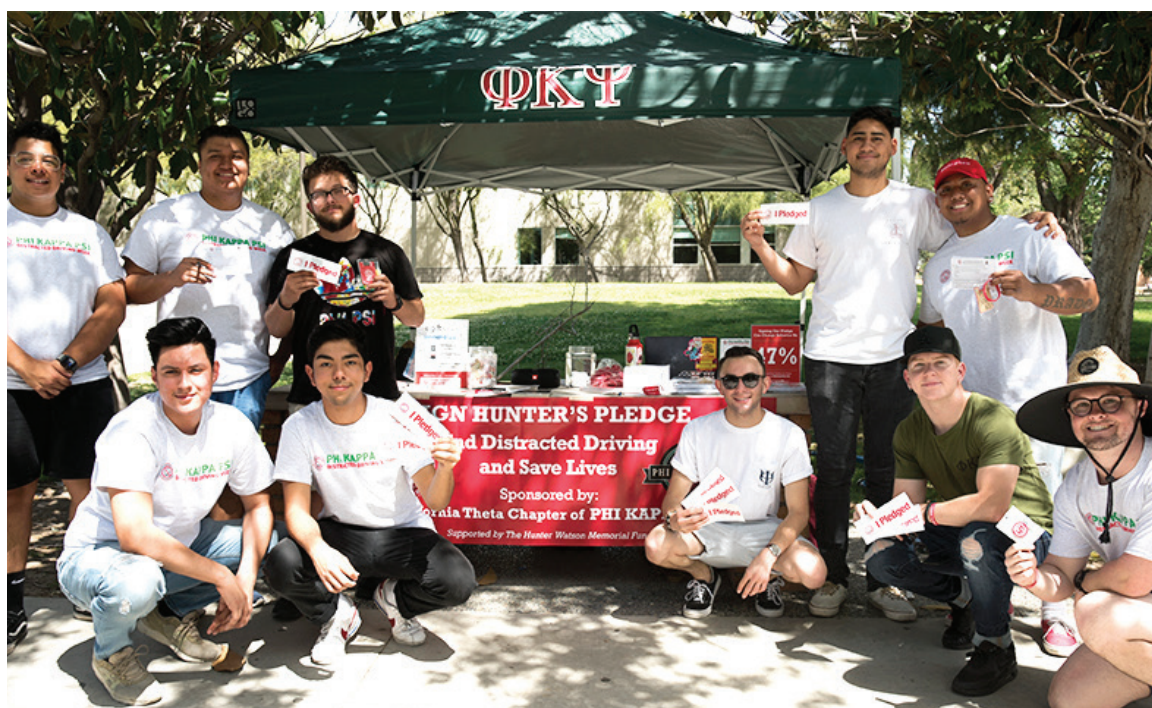
California Theta Chapter of Phi Kappa Psi

Our campus is very diverse, and so are our 32 brothers of Phi Kappa Psi. We are known for being very vocal and supportive, and for our strong brotherhood.