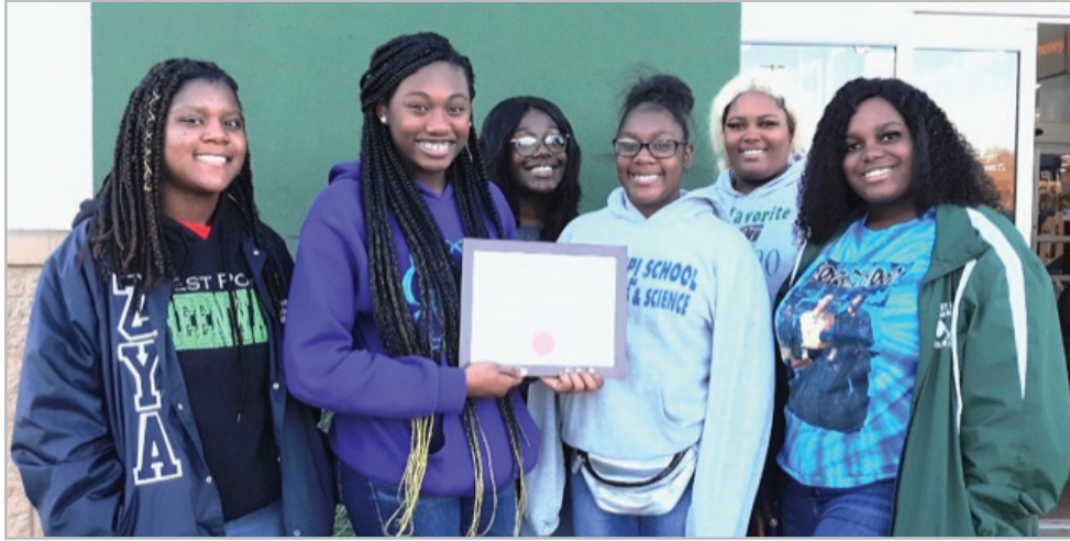
Archonette Club of West Point High School