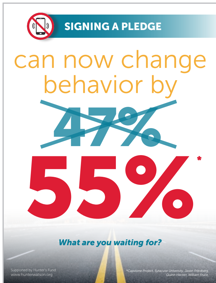
Students signing Hunter's Pledge report 55% change in driving behavior.

Thanks for your help in making this happen!