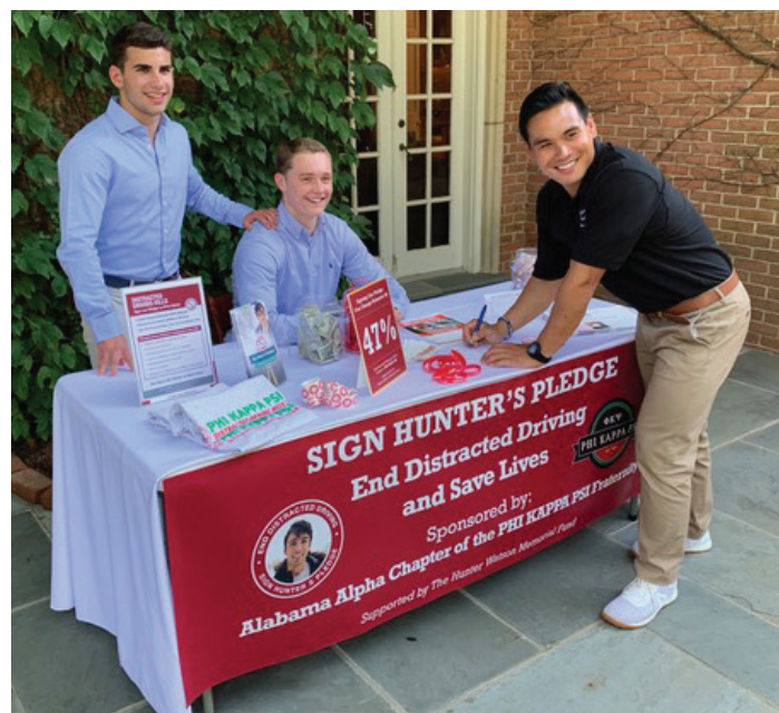
Campaign Kits Used in Safe Driving Program