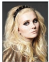
Abigail Breslin From New York, NY Oscar Nominated Actress and singer/song writer living in Hollywood, CA.